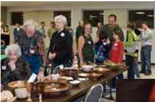
Lots of great auction turnings!