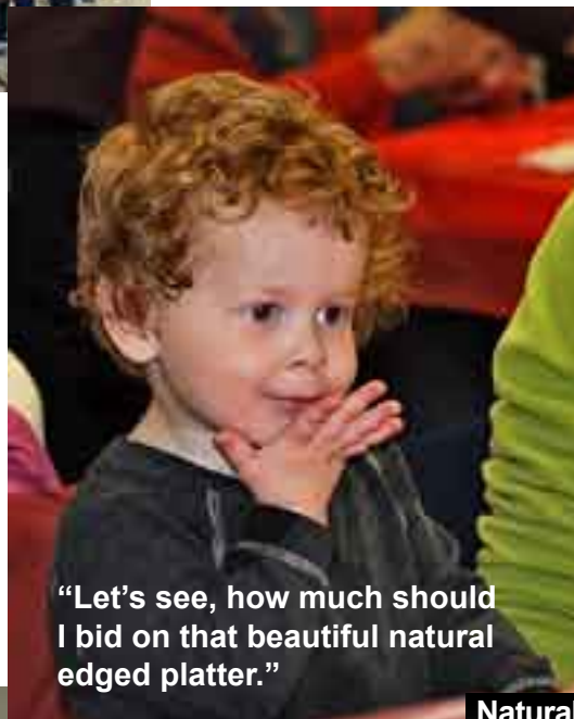
"Let's see, how much should I bid on that beautiful natural edged platter."