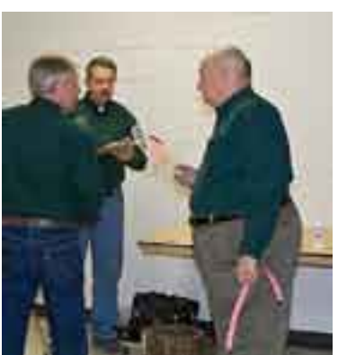
"I don't know what it is, Stormy, but it's unbreakable so you should be OK."