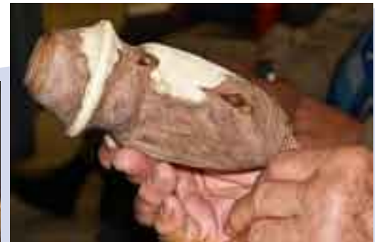
Larry shows that turning “shop critters” is very good practice for developing the basic skills used in woodturning. They are also fun.