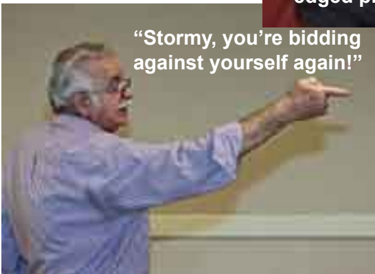
"Stormy, you're bidding against yourself again!"