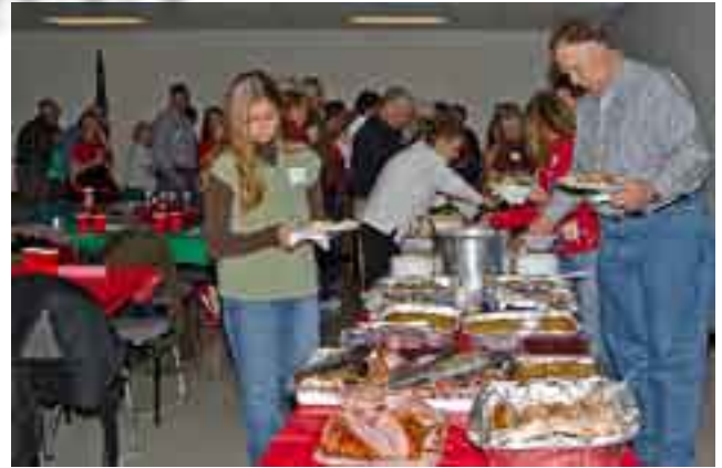
Lots of delicious food and desserts!