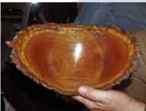
Here are several examples of Larry's natural edge winged bowls.