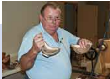
Here he shows some completed winged bowls.