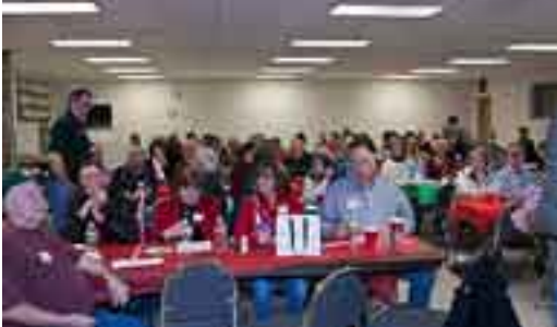
Lots of happy folks!