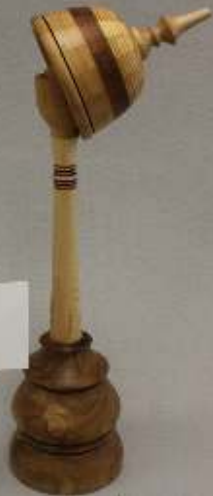
Item ID: 10000