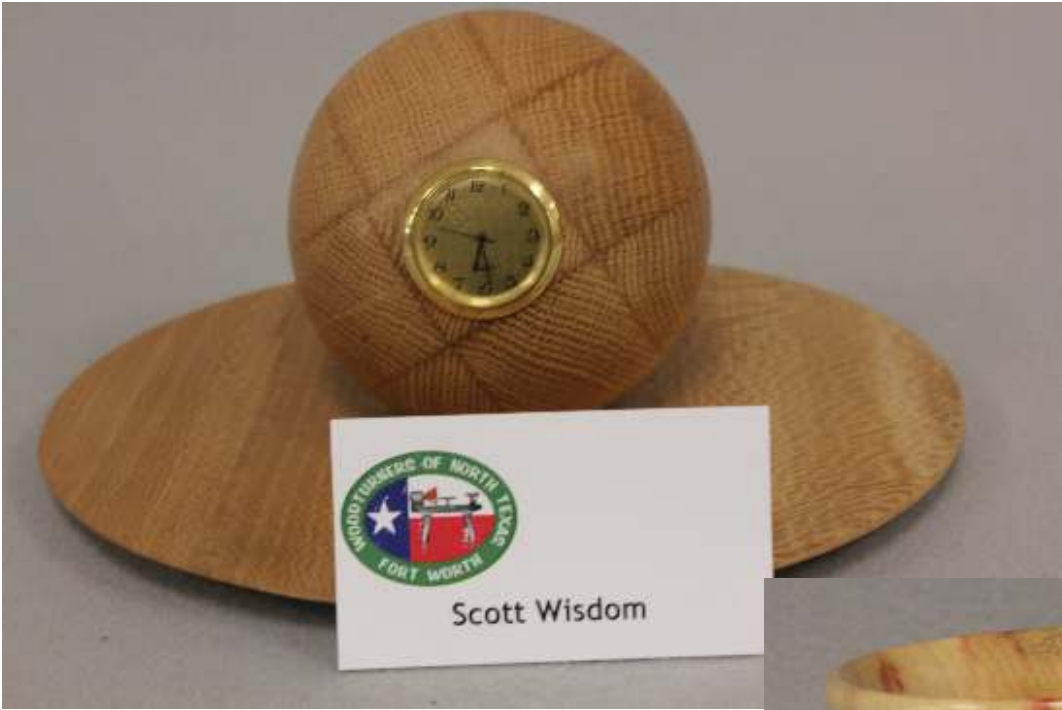
WOODSTOCKERS OF NORTH TEXAS FORT WORTH Scott Wisdom