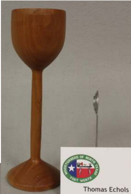
WOODTURNERS OF NORTH TEXAS FORT WORTH Thomas Echols