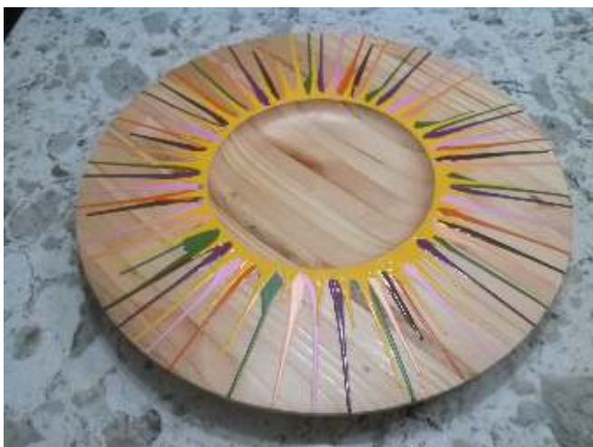
Platter Jim Barkelew