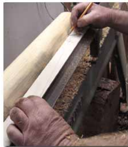
Using template to mark spindle