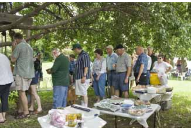
There were plenty of great condiments and desserts.