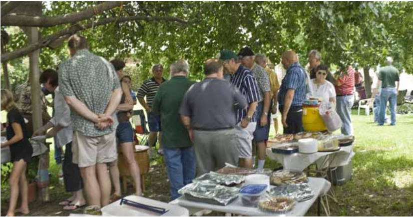
Call Woodturners what you wish, but don't call them late for lunch!