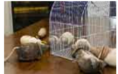
Critters visiting an incarcerated friend