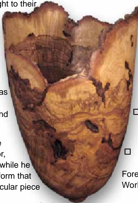
"Sedimentation" 2007 Shumard Red Oak Burl (17 ½" H X 9" D)

One never knows what the inside of the wood will tell but he always enjoys the story. Tales of good times and bad, great forward leaps and tragic setbacks are common in many trees and, hopefully, these are revealed through his works.