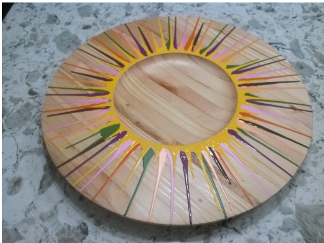
Platter Jim Barkelew