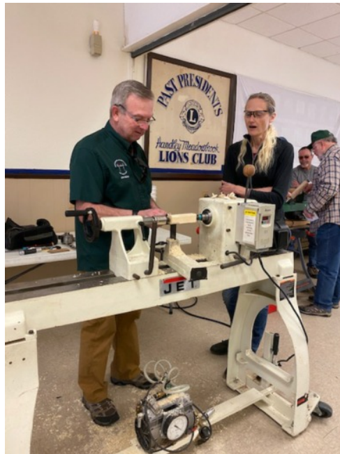
Treadle lathe was a challenge